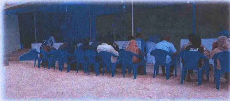
(Voters waiting to cast their vote)