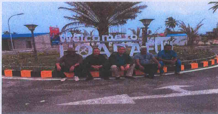
(Delegates from Bhutan and Sri Lanka)

Thank You, Shukuriyyaa, Kadrinchhey and Tashi Delek!!!